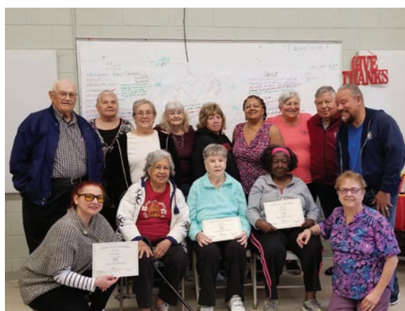
Members of the Dunellen Senior Club pose with their certifications.

The Dunellen Senior Club has been very active in 2019 hosting numerous fun and interesting activities both at the Dunellen Senior Center on Orange Street in Columbia Park and at other venues. A listing of some events include: