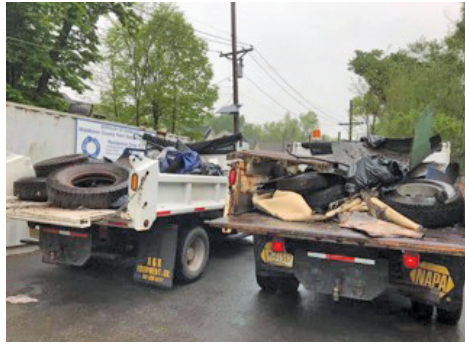
Two DPW trucks holding the debris found in the Bonygutt Brook.

The Dunellen Firehouse was the central meeting place where volunteers were given instructions, supplies and refreshments. Since the brook has many tributaries through the borough, the volunteers went to several sites