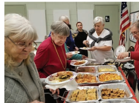
Members of the Dunellen Senior Club enjoy the selections of their International Buffet celebration!